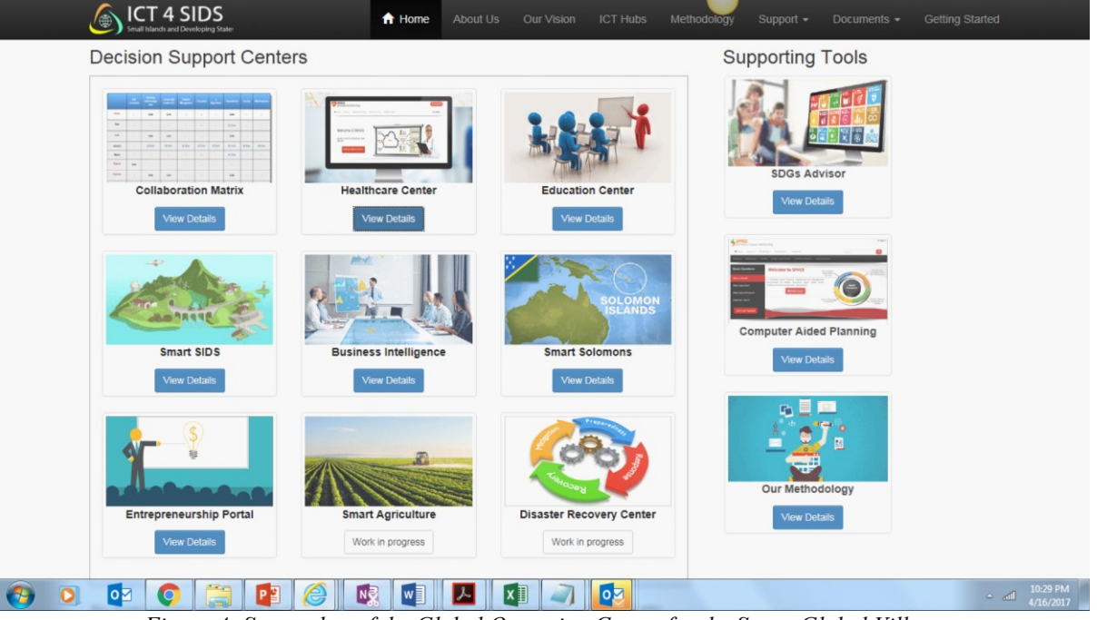
Figure 4: Screenshot of the Global Operation Center for the Smart Global Village

The global decision support center located at Harrisburg University is giving us tremendous opportunities to conduct research on collaboration on different topics at global level. For example, we have collected a great deal of data on hypertension statistics from different population segments with different life styles, social status and diets.